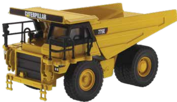
CAT® 775E OFF-HIGHWAY TRUCK

8 5 / 16 x 2 3 / 4 x 4 in. 220 x 70 x 101 mm