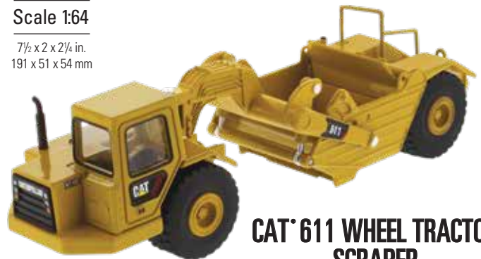
CAT® 611 WHEEL TRACTOR SCRAPER

7 1 / 2 x 2 x 2 1 / 4 in. 191 x 51 x 54 mm