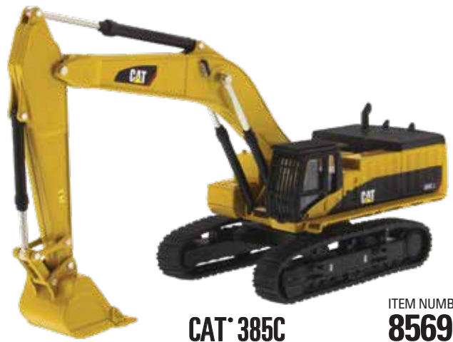
CAT® 385C HYDRAULIC EXCAVATOR