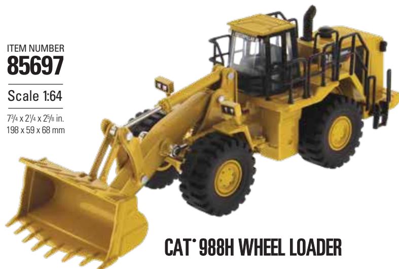
CAT® 988H WHEEL LOADER

7 3 / 4 x 2 1 / 4 x 2 5 / 8 in. 198 x 59 x 68 mm