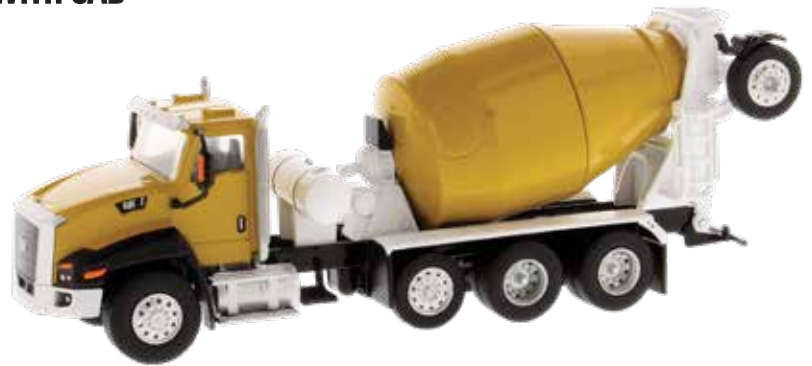
CAT® CT660 MCNEILUS® BRIDGEMASTER® CONCRETE-MIXER