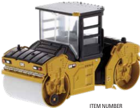
CAT® CB-13 TANDEM VIBRATORY ROLLER WITH CAB