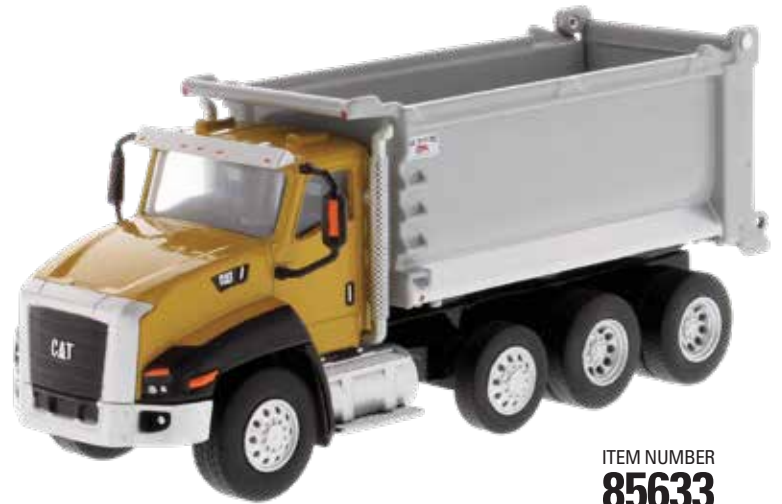
CAT® CT660 OX® STAMPEDE DUMP-TRUCK