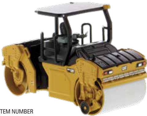
CAT® CB-13 TANDEM VIBRATORY ROLLER WITH ROPS