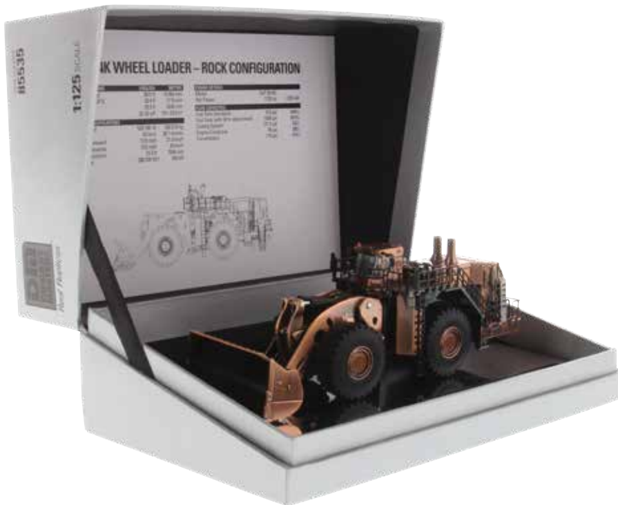
Cat® 994K Wheel Loader Copper Finish

Contact your Diecast Masters distributor today to order.