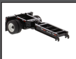
All trailers come with snap-on single-axle and double-axle rear boosters.