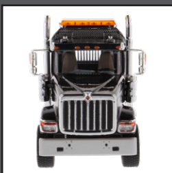
Oversize Load signs can be removed from tractors and trailers.