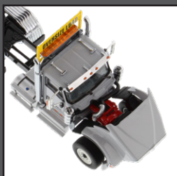
All trucks feature opening hoods and detailed engines.